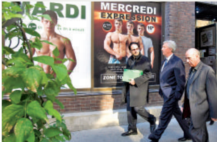
Bloc Québécois Leader Gilles Duceppe, centre, participates in World Car Free Day in Montreal yesterday. The city closed a large area of downtown to traffic from 9:30 a.m. to 3:30 p.m.